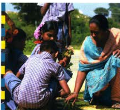
Students observing during nature walk