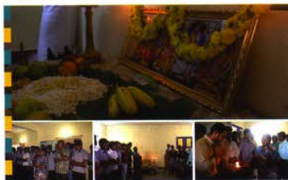
Ayudh Pooja celebration

The Farm acquired by the college in the last year is being suitably utilized by the agriculture students. They were able to cultivate nine varieties of rice in the farm. Along with it, cows, calves and goats have been bought to help generate manure for the farm.