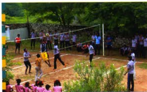
Sports day celebration