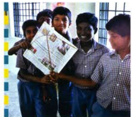
Kite-making activity by students