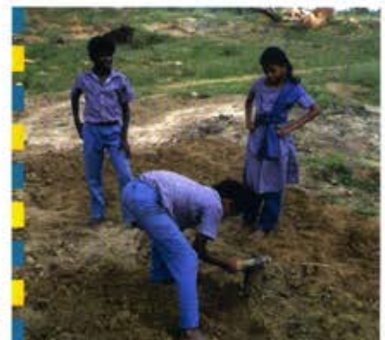
Students doing gardening